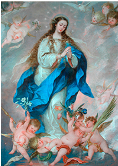
Jose Antolinez The Immaculate Conception , 1650-75