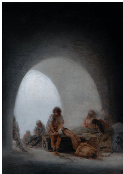
Francisco Jose de Goya Interior of a Prison , 1793-94