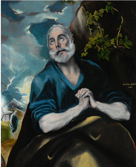
Domenikos Theotokopoulos El Greco The Tears of St Peter , 1580-89