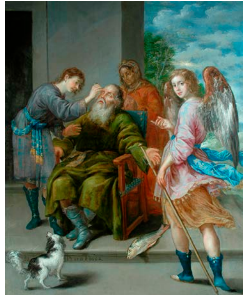
Antonio Pereda y Salgado Tobias Restoring his Father's Sight, 1652